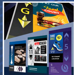
Easy to use Software